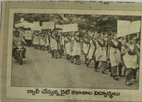
ర్యాలీ చేస్తున్న రైట్ కళాశాల విద్యార్థులు