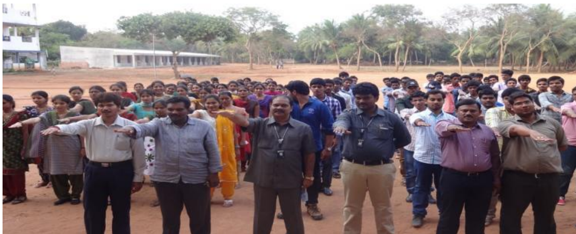
NSS volunteers taking oath for active participation in voting system